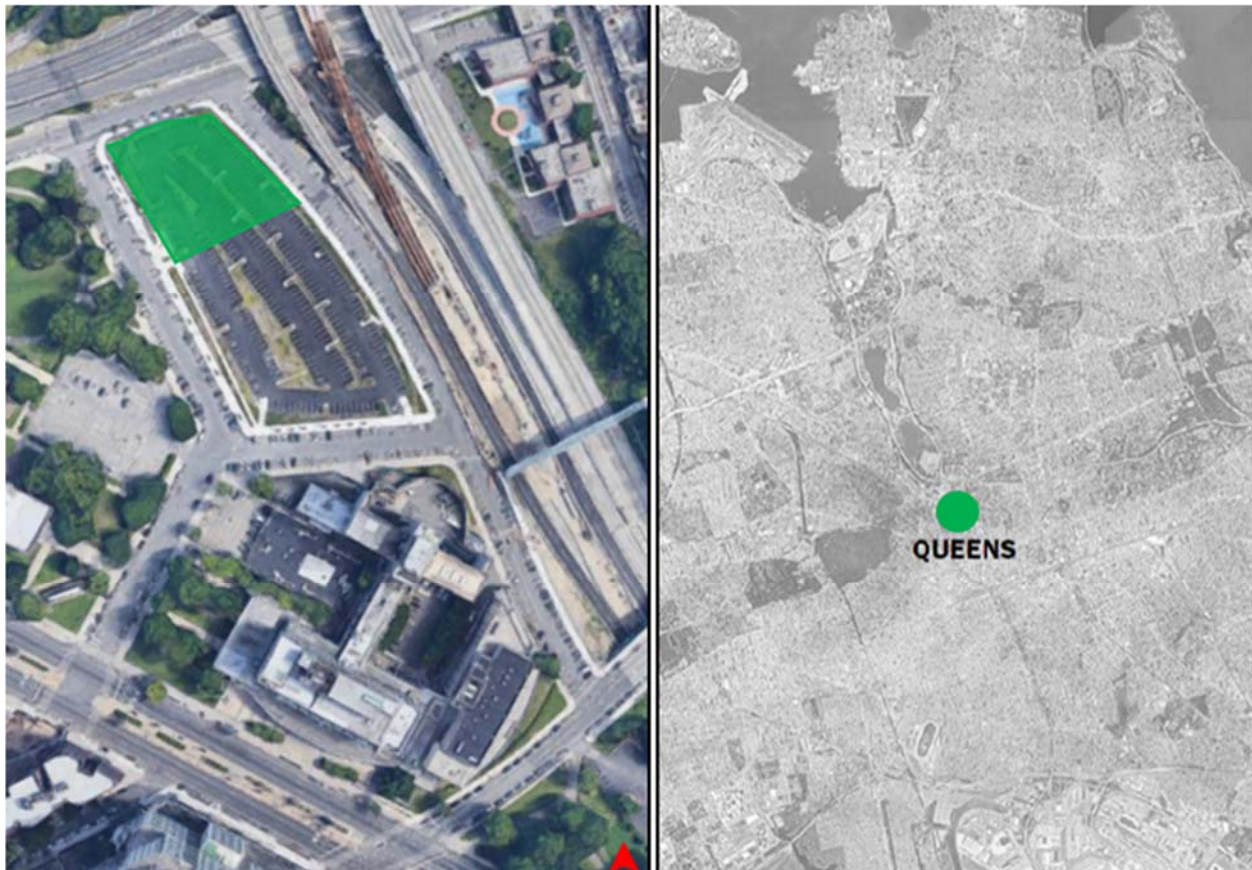
Figure B-1 BBJ-Q Parking Location

The site is currently operated by DOT as the Queens Borough Hall Municipal Parking Lot (see Figure B-2). The new parking garage facility will occupy approximately 40,770 sf footprint of the northern section of the site with the Union Turnpike service road to the north, 126 th Street to the east and site access at 132 nd Street to the west, as depicted by the area shaded in green in Figures B-1 and B-2. The site is within a C4-4 zoning district.