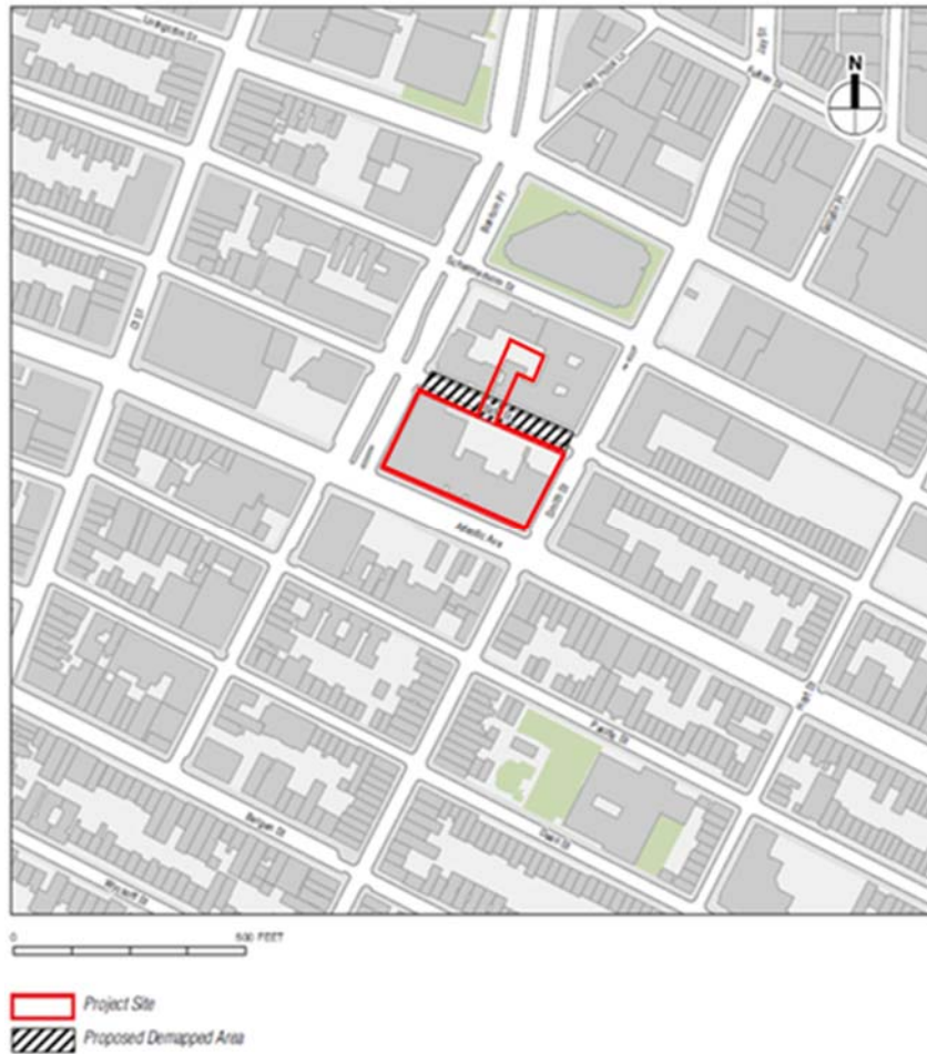
Figure B-2 BBJ-K Map Location