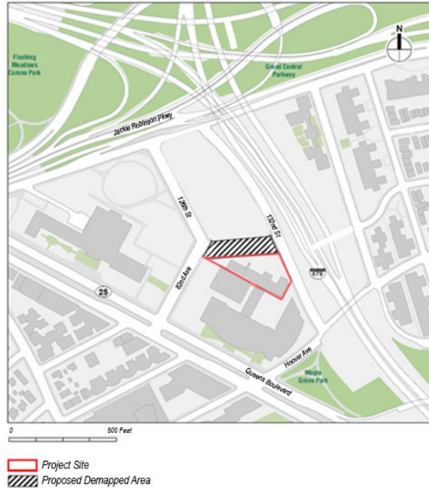
Figure B-10 BBJ-Q Map Location