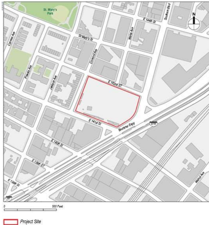
Figure C-2 BBJ-X Map Location