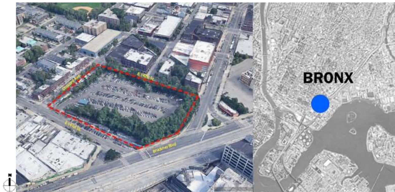
Figure C-1 BBJ-X Location

The Bronx Detention Facility is located at 745 East 141st Street (Block 2574, Lot 1) in the Mott Haven neighborhood of the Bronx Community District 1 (see Figure C-1 ). The site is within the block bounded by East 142nd Street, Southern Boulevard, Bruckner Boulevard, East 141st Street, and Concord Avenue (see Figure C-2 ). The site is within an M1-3 zoning district. The site is currently occupied by the NYPD Bronx Tow Pound. Tow Pound operations will be relocated by NYPD prior to the start of work. This site was formerly occupied by Lincoln Hospital. The roughly 145,635 sf site contains a small office structure, storage sheds, space for vehicle storage, and is surrounded by a fence and trees.