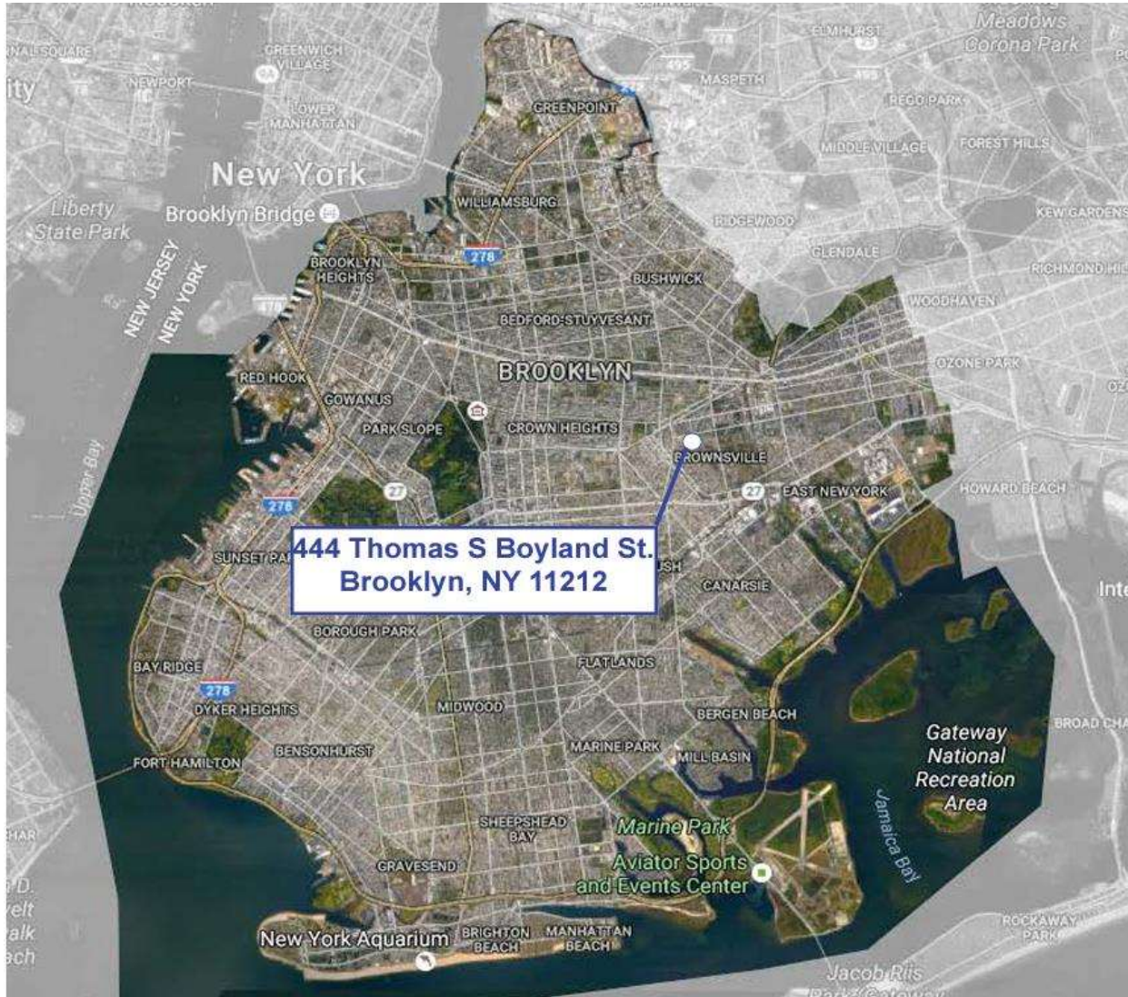
Aerial View, Borough