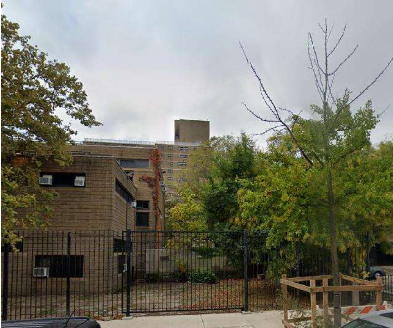
View of East of main entrance