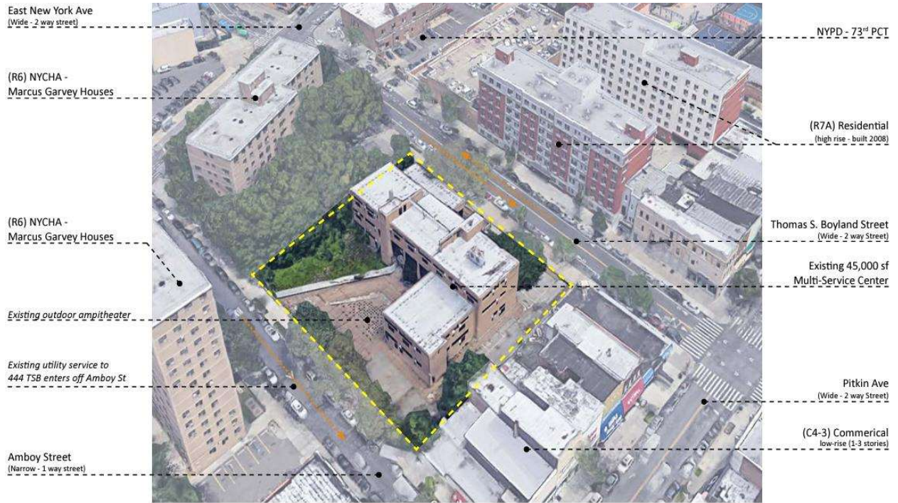
Aerial View, Project Site