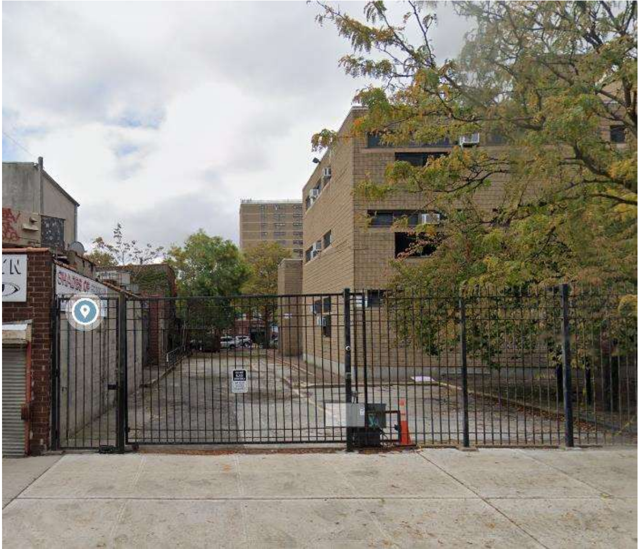
View of parking lot West of the main entrance