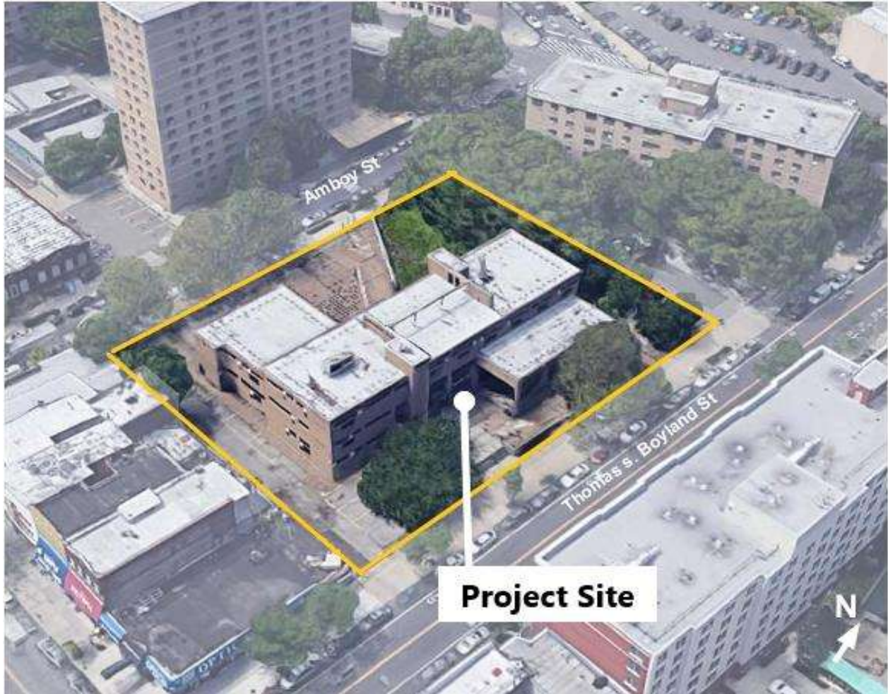
Aerial View, Site