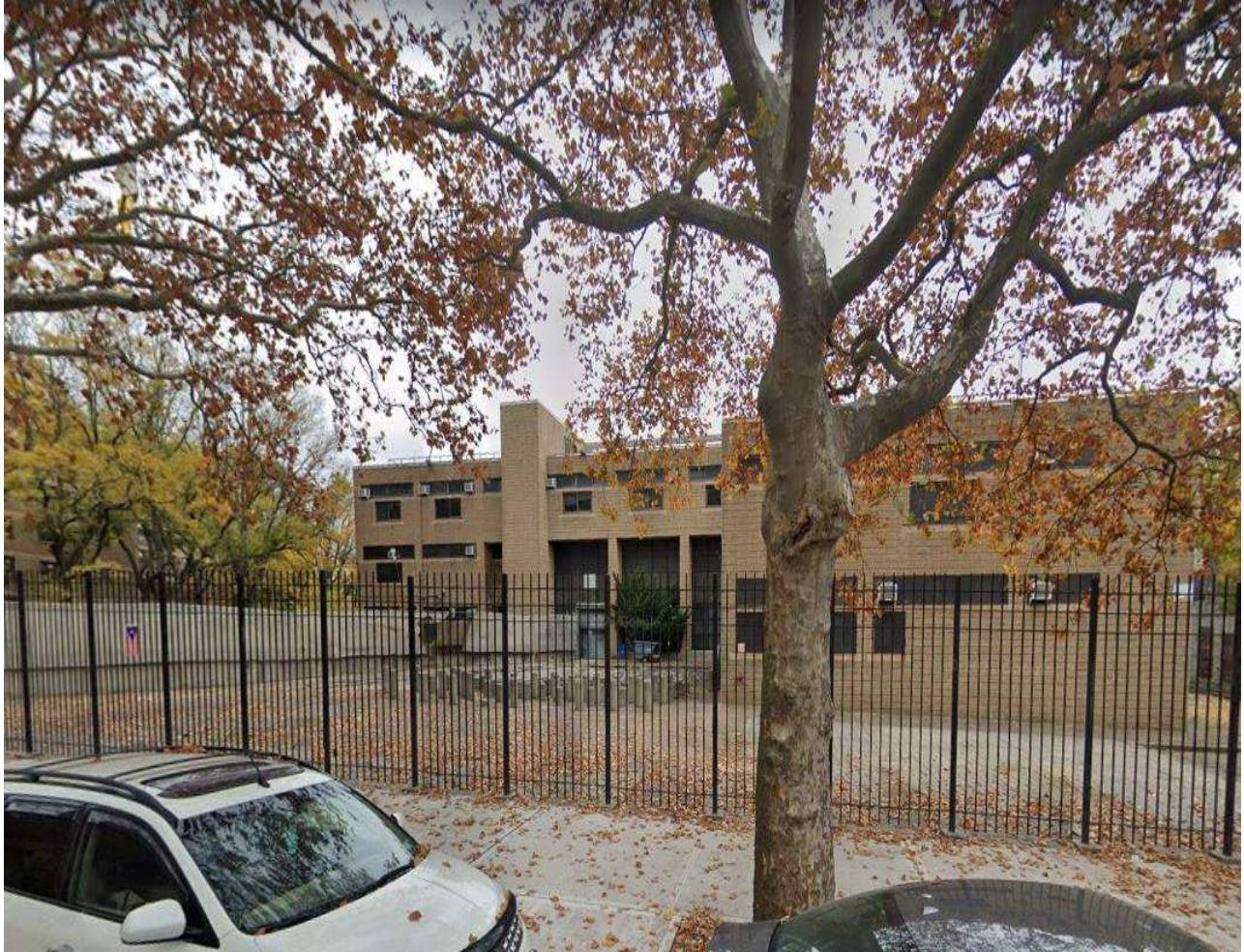
Amphitheater located South of main entrance